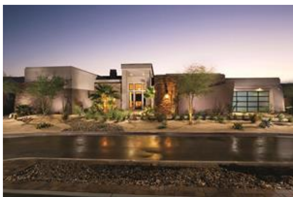
Ibiza Contemporary - Estilo at Rancho Mirage

HORSHAM, Pa., June 07, 2017 (GLOBE NEWSWIRE) -- Toll Brothers, Inc. (the " Company " or " we ") (NYSE:TOL) ( www.tollbrothers.com ), announced today that it has priced an underwritten tack-on offering (the " Offering ") of an additional $150 million of the 4.875% Senior Notes due March 15, 2027 (the " Additional Notes ") previously issued by Toll Brothers Finance Corp., a wholly-owned subsidiary of the Company. The Additional Notes will be issued at an issue price of 103.655% of principal plus an amount equal to accrued interest from, and including, March 10, 2017 to, but excluding, June 12, 2017. Settlement of the Additional Notes is anticipated to occur on June 12, 2017, subject to the satisfaction of customary closing conditions.